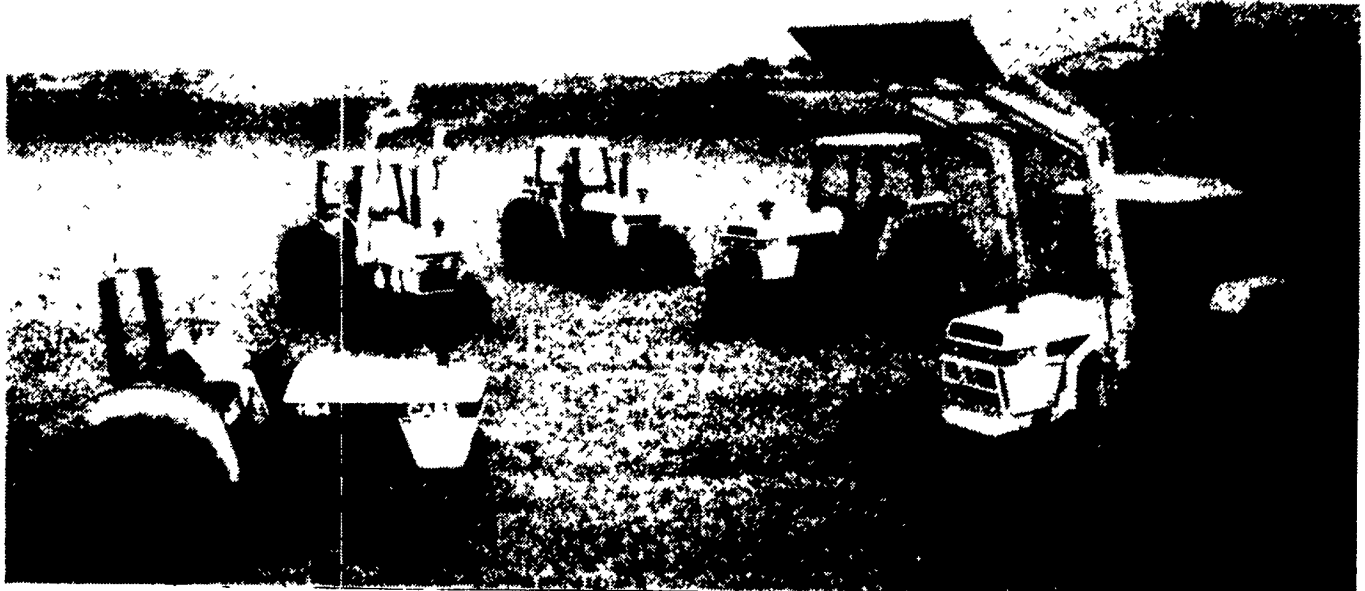
Model 1194; 43 hp (32kW)* Model 1294; 55 hp (41kW)* Model 1394; 65 hp (48kW)* Model 1494; 75 hp (55kW)* Model 1594; 85 hp (63kW)*

Now Is The Best Time To Buy. Special Programs And Discounts On Tractors And Unloaders. Ends November 1984.