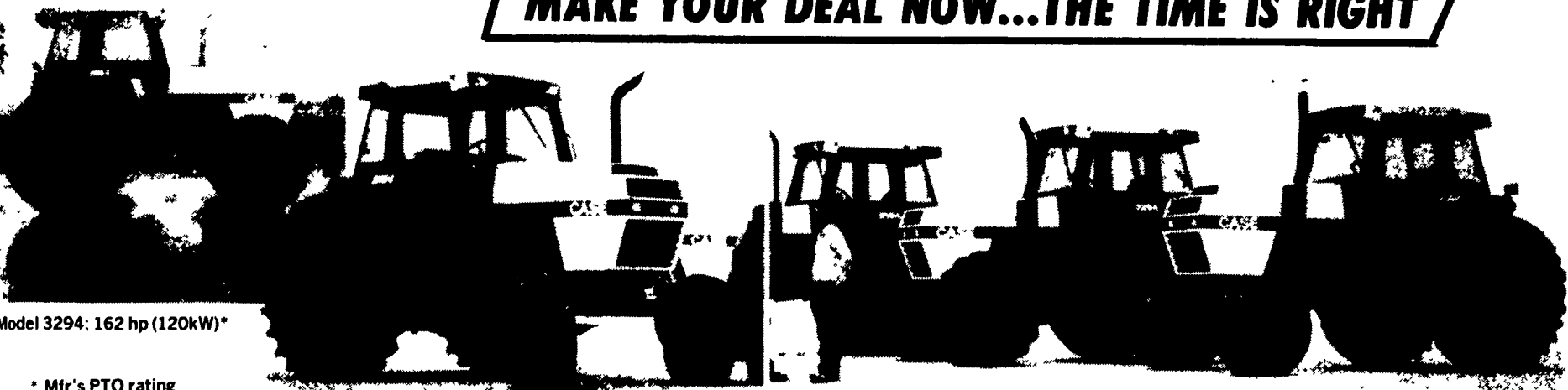
Model 3294; 162 hp (120kW)*