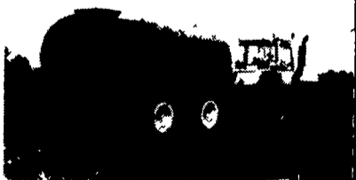
LIQUID TANK SPREADERS 6 sizes to choose from 1200 gal to 5000 gal.

ALL EQUIPMENT IN STOCK READY FOR DELIVERY We Need Good Used Liquid Manure Equipment