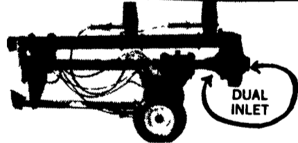
MODEL K31 LIQUID PUMP (3600 GPM)