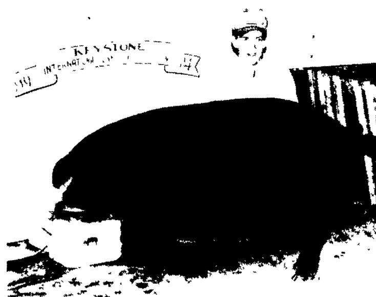
Smith's Hog Farm again with champion Duroc gilt at KILE.