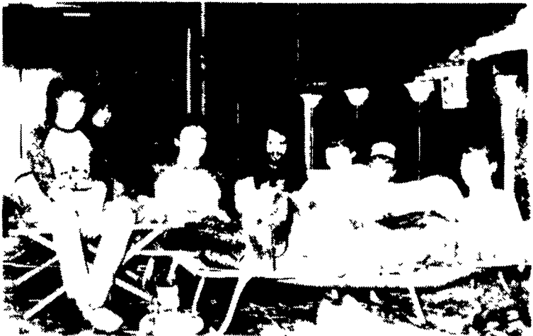
These western Pa. sheep exhibitors were caught roughing it, KILE-style. Now this is dedication! Can everyone spot our Pa. Wool Queen?