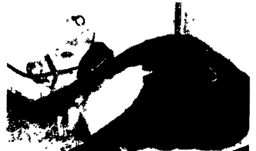
"Phew! What a day. My feet are killin' me."