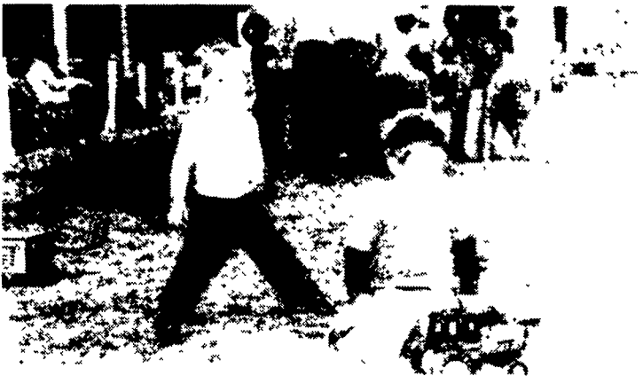
"You guys go ahead and show your sheep. We got some serious farmin' t' do!"