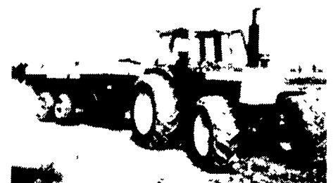
FORD TW-15, 4-WD