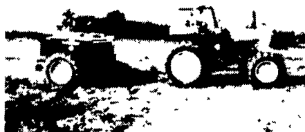
FORD 7710, 4-WD

WE ARE OFFERING 2 - DEMO SPECIALS AT FANTASTIC SAVINGS