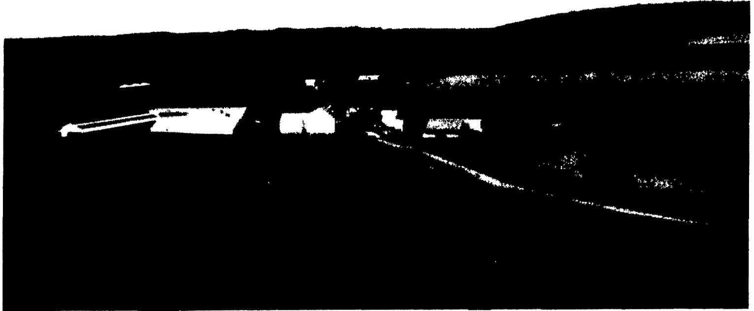
Rothrock complex is nestled in the picturesque rolling hills near Kempton, Pa.

The "Valiant" son of Northcroft Ella Elevation, the All-American, All-Canadian, 3E-97, cow; and the "Bova" son of Long-Haven Wayne Stephanie, the "Excellent" cow with a +2206 cow index, are drawing avid A.I. and breeder interest to the sale. The "Stephanie" cow just finished a 51,765 pounds of milk record. The 26 young, contract or ET cows, and the 42 outstanding pedigreed heifers are also sparking interest