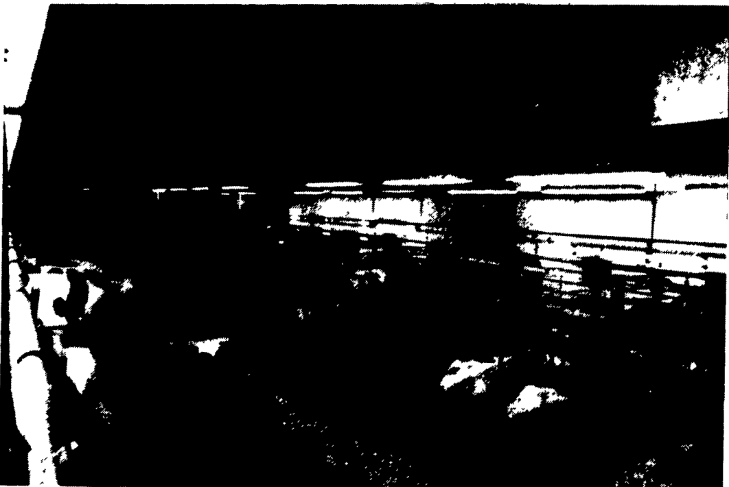
Cows are housed in comfort stalls at Rothrock. View is from conference room that looks out into the barn.