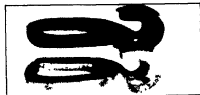
Heavy-duty link (top) and extra heavy-duty link (bottom) for long chains and heavy loads