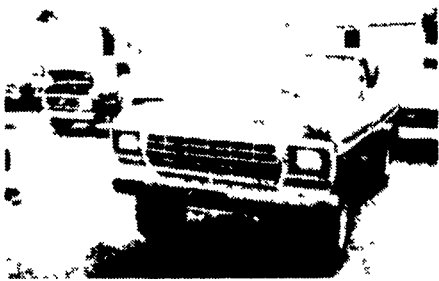
77 Ford F250 4x4, Auto Eng., P/S, P/B, New Paint $4,495