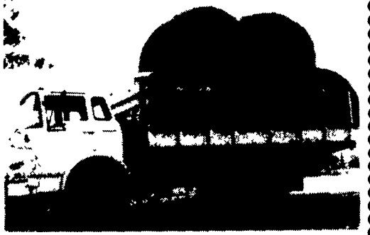
Chevrolet 60 Series Cab Over, 55,000 Mi. 2-Speed Rear, Rebuilt Motor. Heavy 2-Cylinder Hoist. Excellent Condition - Must See