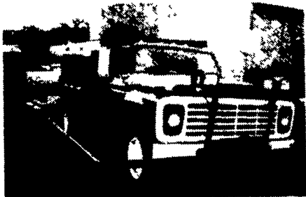
77 F700 5-6 Yr. New Eng. 5 Spd. P/S, Plow, New Paint $8995