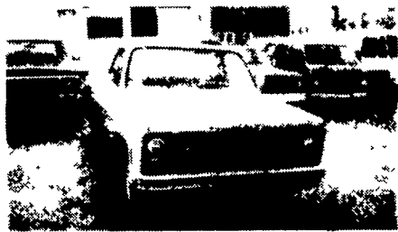
80 GMC PU 6 cyl, Auto, P/S, 21,000 Miles $3,795