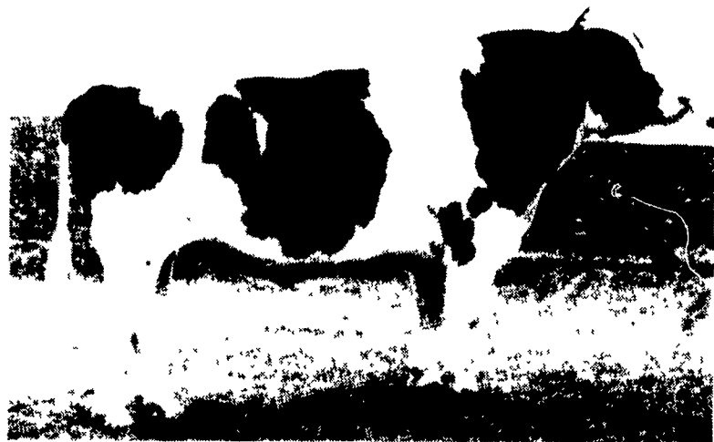
29H4530 Scenic-View Chief APOLLO J VG-85