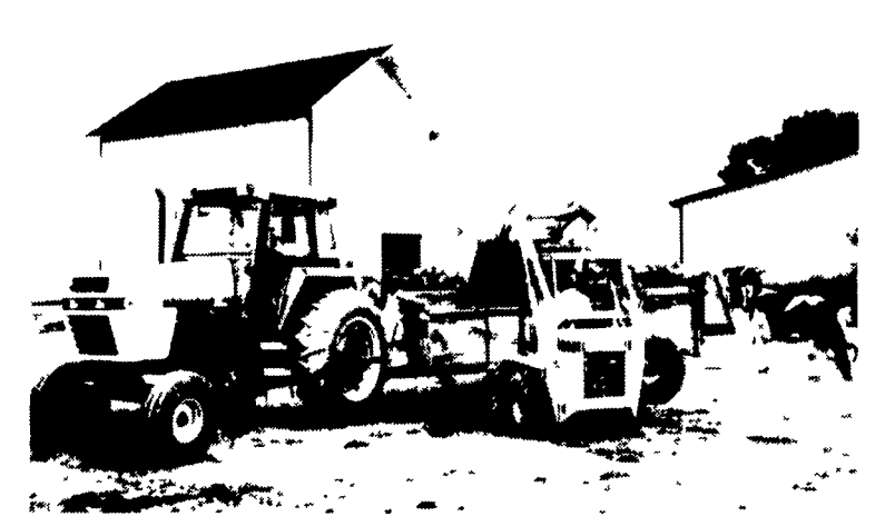
A variety of hitch applications are possible with new 96 Series tractors from J I Case.