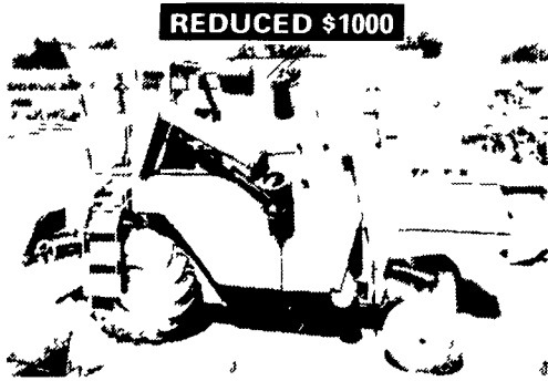
REDUCED $1000 1974 WHITE 7300 13' Qt. Head, Pickup Reel, Floating Cutter Bar, Reel Lift, Clean, Original ONLY $8450 3 & 4 Row Heads On Stock