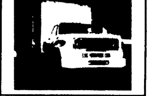
1978 Chevrolet CE66703, 14 Van 23180 Lb GVW 368 V8 Eng Clark 5 Spd Trans P/S 7 000 Lb FA 17 000 Lb RA 9 00x20 Tires Duralite 14 Van O/H Rear C/S Door Slatted Interior TRANSMISSION OVERHAUL ED