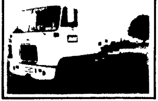
1978 Chevrolet D9L084, T/A/D/S 150 WB Formula 350 Cummins 9 Spd P/S A/C 10 00x20 Tires Both Under 200 000 Miles Engine Overhauled