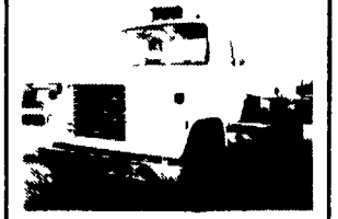
1978 Ford LN9000, S/A/D/C 150 WB 6 71 N Detroit RT910 10 Spd Trans P/S A/C New Paint Engine Just Over hauled