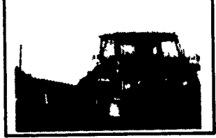
1980 & 1979 IHC CO1610B 16 Van 137 WB 392 V8 Eng 5 spd Trans P/S 9 00x20 Tires 16 Morgan Body Overhead Rear Curb & Roadside Doors Trans Rebuilt New Paint, Engines Overhauled