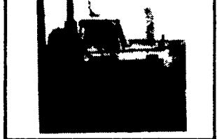
(2) 1978 Whites, Road Boss II Tandem Axle Conv 143 WB Formula 290 Cummins 10 Spd P/S, 10 00x20 Tires Air Shield