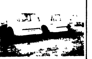
(2) (3) 1978 Fords C7000 24 Cab & Chassis 27 500 GVW CAT 3208 (200 H P) 5 Spd Trans 2 Spd Rears P/S Engines Overhauled