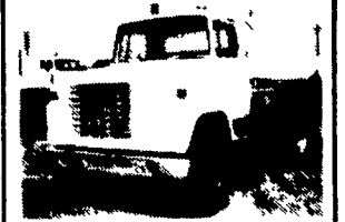
1979 Ford LN9000, S/A/D/C 138 WB 6 71 Detroit 10 Spd P/S 10 00x20 Tires NEW PAINT, ENGINE OVER HAULED