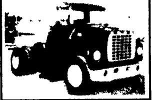
1978 Ford LN9000, S/A/D/C 138 WB 6 71 Detroit (238 H P), 10 Spd Trans P/S 10 00x20 tires ENGINE OVER HAULED, NEW PAINT