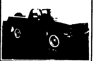
1983 Chev Blazer, 4 Wheel Drive Silverado Equipped 305 V8 4 BBL Auto Trans P/S A/C PW AM/IFM Radials Towing Package Color Red

MISCELLANEOUS 1973 Fruehauf 42'x12'6" Tandem Axle Van w/LG, Slider, E-Track, O/H & C/S Doors, Walco Liftgate 3,000 Lb 1984 Maxon Liftgate RC3, BRAND NEW 90' x60' x16" Railift - Never Used