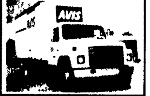
1979 IHC S1654 14 Van w/LG, 19 200 Lb GVW 345 V8 Eng Allison Auto Trans P/S AM Radio Duralite 14 Body O/H Rear C/S Doors Slatted Interior, Walco Liftgate TRANS MISSION REPLACED