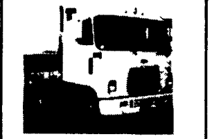
1978 Chevrolet D9L042, S/A/D/S 142 WB Formula 290 Cummins 10 Spd Trans P/S A/C 10 00x20 Tires 100 Gal Tanks NEW PAINT