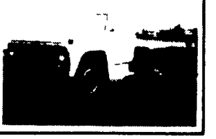
1978 Ford F700, 16 Cab and Chassis CAT 3208 Engine 200 H P 5 Speed 2 Speed Rear 27 500 Lb GVW P/S 10x20 Tires NEW PAINT