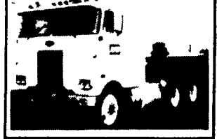
1978 Peterbilt 352506 T/A/D/S 148 WB NEW SILVER 8V92TT Eng w/Warranty 9 Spd P/S A/C AM/IFM