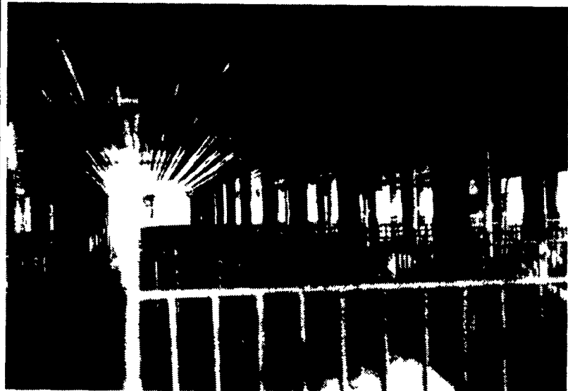
Pictured Above: 50'x100' Remodeled Hog Building 700 Head Growing/Finishing Capacity (Remodeled From A 3-Story Chicken House)