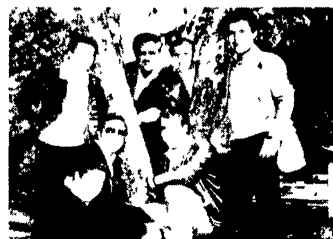
The Dixie Melody Boys

For Advance, Brochures, Information Write: GARDEN SPOT PROMOTIONS P.O. Box 531, Ephrata, PA 17522 PHONE: (717) 665-2317