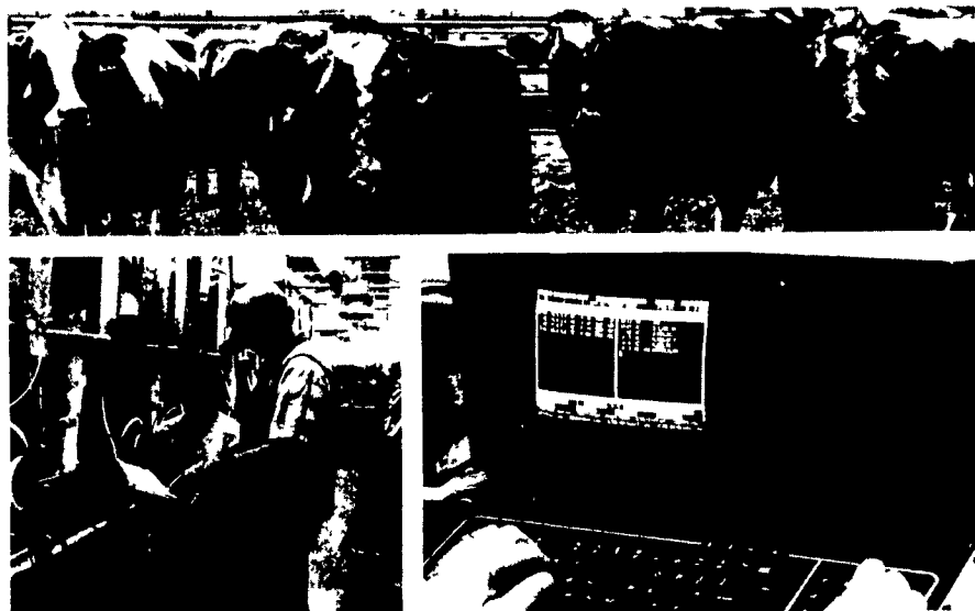
"I had no prior training - I follow the computer's instructions!" Edna Rocco