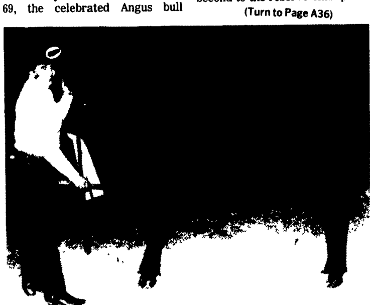
Emily Weaver's first-place lightweight steer was named reserve champion.