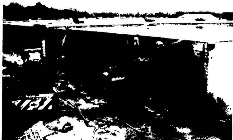
Block Wall Being Restored With Gunite