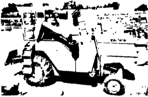
1974 WHITE 7300 13' Qt. Head, Pickup Reel, Floating Cutter Bar, Reel Lift, Clean, Original ONLY $9450 3 & 4 Row Heads On Stock