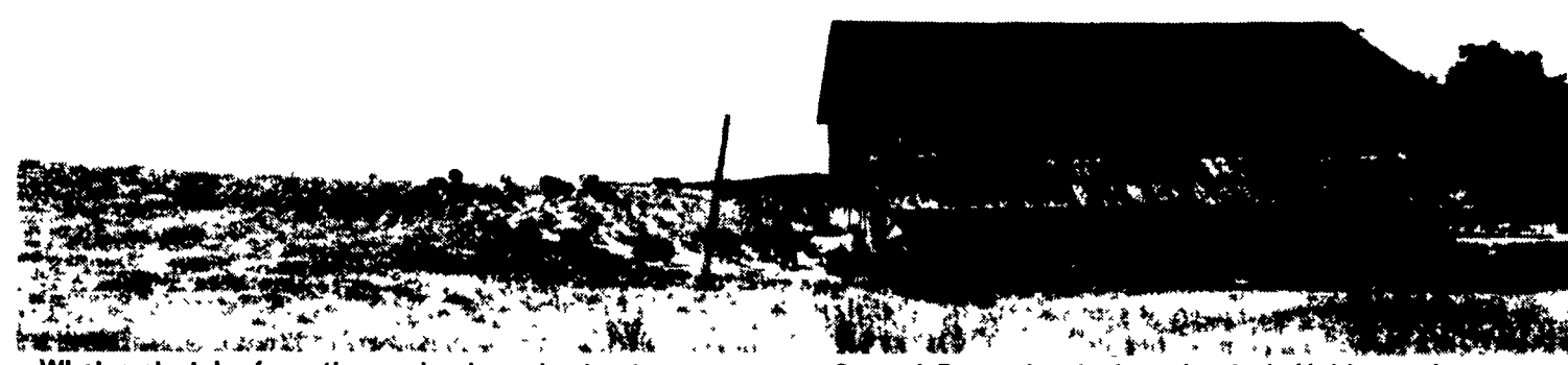
What a stretch of weather we've been having lately. The corn is drying down; the tobacco curing; and fields and gardens yielding their final bounty. This photo, taken on a