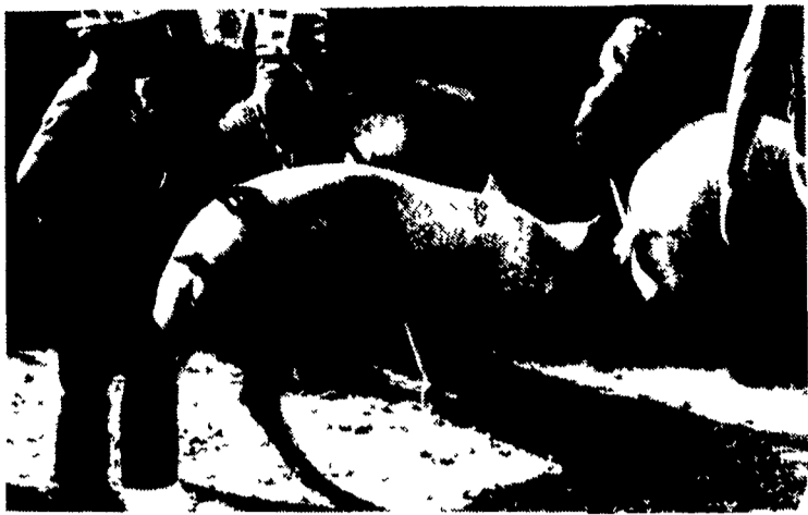
Keeping scrapping entries separated is a big job for small exhibitors at the 1983 Solanco Fair in Quarryville.