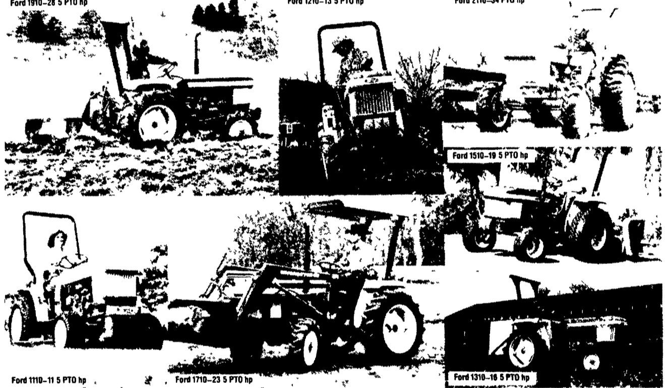
Ford 1110-11 5 PTO hp