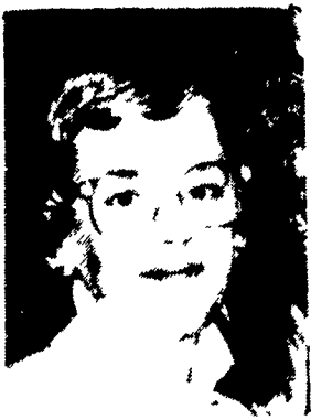
Buying And Caring For Leather And Suedes

Genuine leather or suede garments are more than just attractive, they are a sound investment that will probably last twice as long as woven fabric garments. Quality leather softens