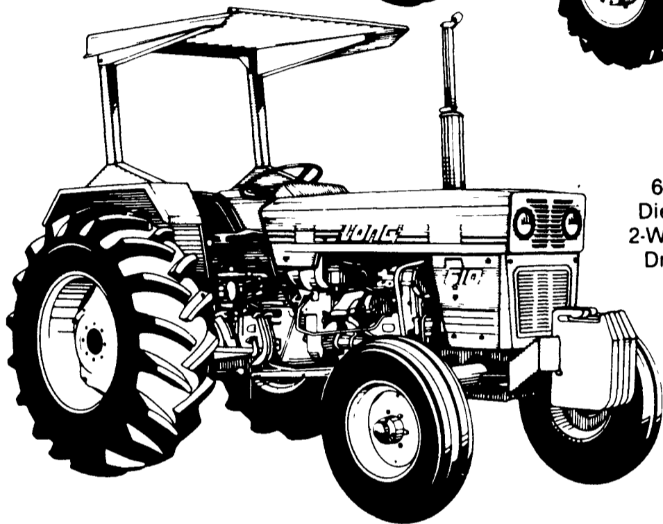
610 Diesel 2-Wheel Drive

The Long 610 Tractors are precision-engineered for outstanding quality, performance and economy. Standard features include: Independent PTO, 8 forward and 2 reverse speeds, differential lock, hydrostatic steering, plus more. A demonstration of the Long 610 2-wheel drive and the 610-DTC 4-wheel drive model will prove that Long DOES deliver quality at an affordable price!