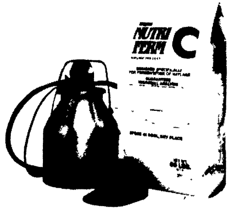
Specially formulated for corn silage. Nutri-Ferm/C produces higher quality silage year after year.

Wayne ™ Nutri-Ferm ™ /C First-Rate Corn Silage Time After Time After Time