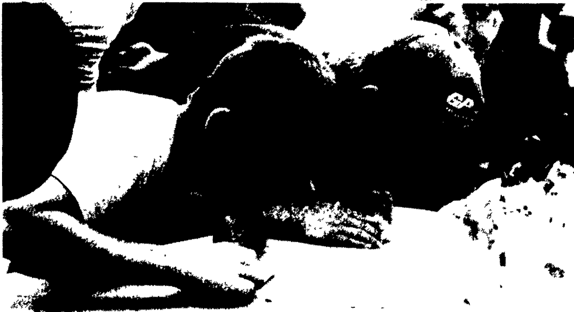
This boy apparently doesn't care about seeds as he participates in the watermelon eating contest.