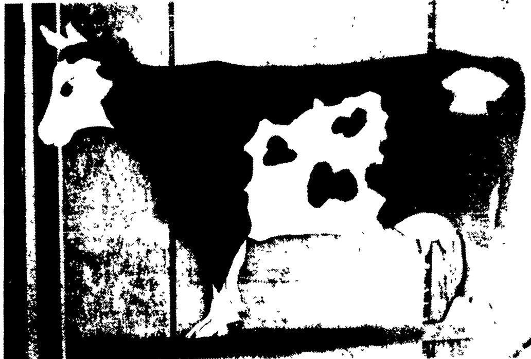
Cows and weathervanes make a natural combination, and this wall hanging is a sample of the work done by Chuck and Margaret Layland, Birdsboro. This majestic cow is also available as a weathervane.