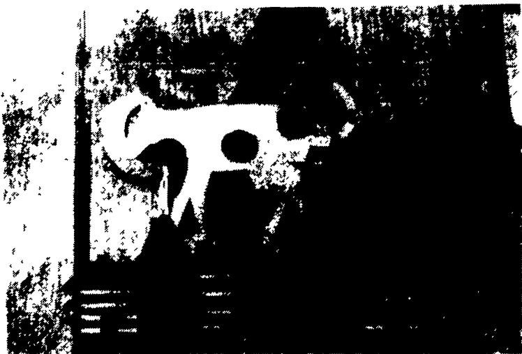
The cow jumped over the moon - and Dawson Gillaspay created these metal wall hangings to keep the cow in just the right position.