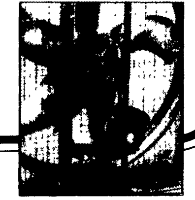
High-efficiency, capacitor-run fan motor is ended by self-tensioning, easy-to-replace belt to minimize belt slippage for reliable, efficient performance and minimal maintenance Fan bearings are self-aligning and pre-lubricated with ammonia-resistant grease for long life