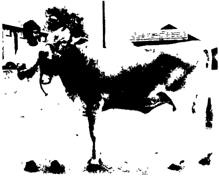
Brown Swiss grand champion at SE FFA Show with Bruce Heilinger, R1 Newmanstown.