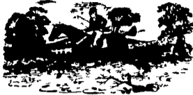
polka music and you'll understand exactly how come

Plant winter rye in fallow fields now Tarzan of the Apes published August 27, 1912 Average length of days for the week, 13 hours, 15 minutes First quarter of the moon Sept 2 (Sun) Non-aggression pact signed by Afghanistan and Russia, Aug 31, 1926 Japan Stationery Co sold first felt-tipped pen, Aug 30, 1960 Forest fire in Hinckley, Minn., killed 418, burning 160,000 acres, Sept 1, 1894 A great deal of what we see depends on what we're looking for