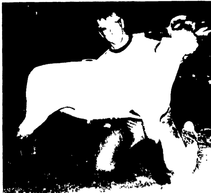
Mike Koehler, of Allentown, recorded multiple top breeding and market lamb wins at Kutztown Fair.