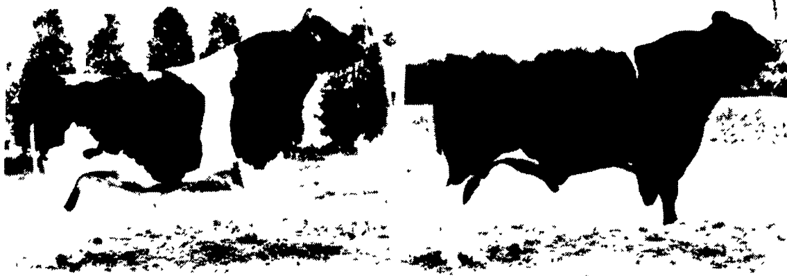
Two new Pa. additions to Select Sires lineup include Len-Lyn Jerry Heston-ET, left, and Ro-Ka-H Arlinda Star-ET.