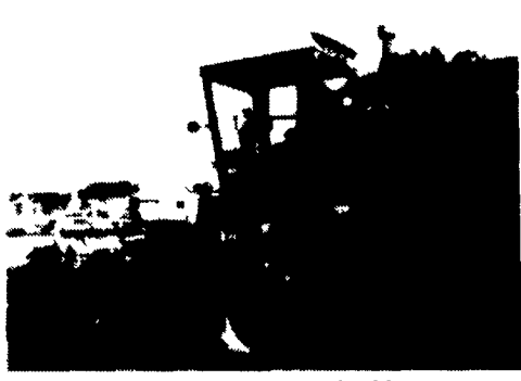
4400 G Combine 1680 Hours 4400 D Combine 2510 Hours