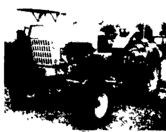
Ford 8000 Tractor, Dual Remote, 18.4x38, Runs Good . . . . $6,950