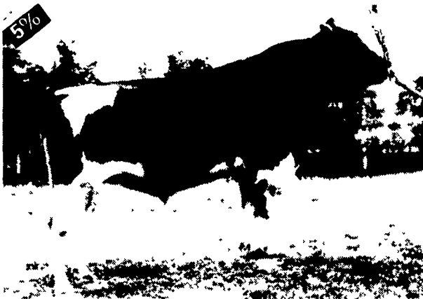
15H318 Kranzdale Rebel 7/84 USDA PD82 +$99 +177M +.25% +51F 55% R Protein +$102 +.01% +8P 44% R HFA PDT +.74 57% R