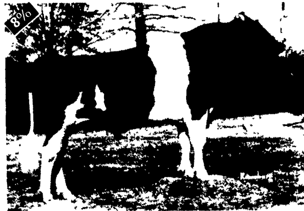
15H231 Kingway Elevation Very 7/84 USDA PD82 +$70 -161M +.31% +47F 99% R Protein +$60 -.04% -13P 98% R HFA PDT +.71 96% R