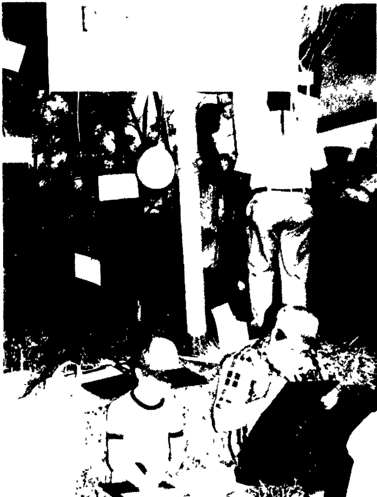
A couple of youngsters pause at 1983 Ag Progress to draw their family and enter artistic competition.

Other exhibits will look at sewing, how to lead a healthier life and the role of carbohydrates in good nutrition.