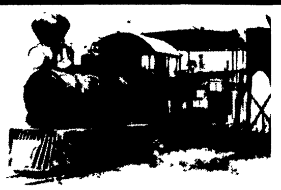
The Shay - Early 1900's Steam Powered Logging Locomotive With Added Observation Car.