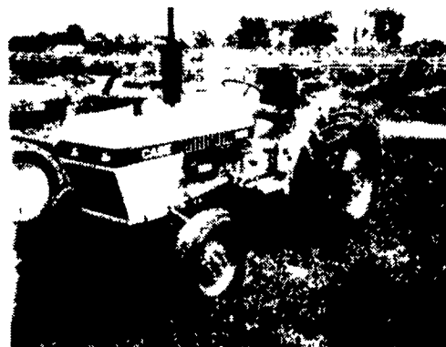
NEW CASE 1190 43 H.P. Diesel - Must Sell $8775 Or Best Offer.