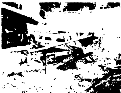
NH 478 7' HAYBINE One of the Nicest Used Ones Around Very Clean - $4950