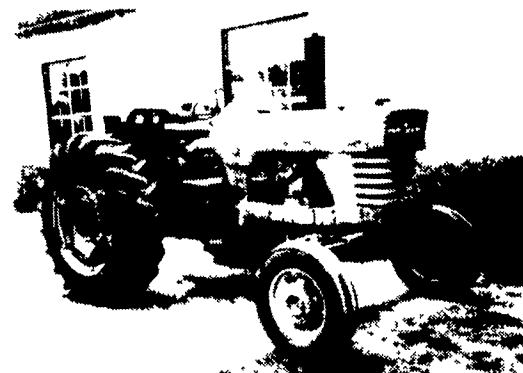
MASSEY FERGUSON 1080 DIESEL 1969 - Just Arrived - $6900