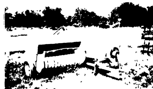
FORD 530 BALER Like New SUPER SHARP, Less Than 1/2 Of New - $3500 Lots More On Stock