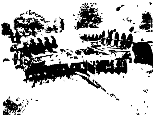
LATE MODEL MASSEY FERGUSON 20' Wing Disc Excellent Original Unit Only - $3500 Lots More on Stock