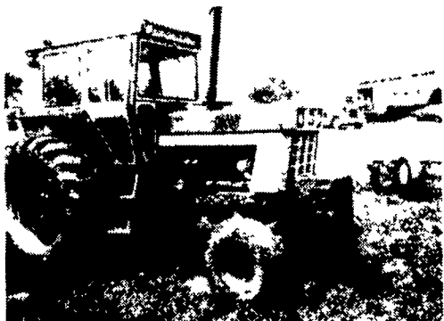
VERY CLEAN IH 1466 - Air-Loaded-w/weights-2 Remotes-2 PTO's-2900 Hrs., Exceptional Quality $10,800.