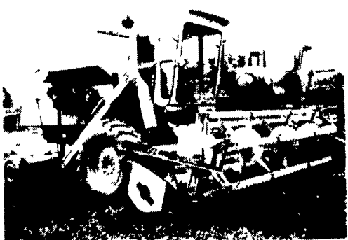
ALLIS CHALMER GLEANER "G" With Grainhead - Very Clean Original Machine - $8950 Corn Heads Available