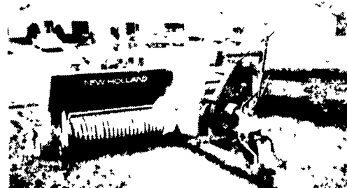
NH 315 BALER With Fold-Up PTO Thrower, Used 2 Seasons Very Nice - $6950 More On Stock