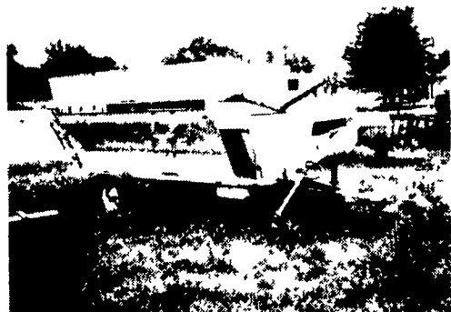
SCHWARTZ 760 MIXER WAGON Heavy Duty Inside Augers Original Paint - Operating Condition - $3500.