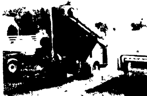
NH 354 MILL Very Clean - Original Buy Early Before Fall Only - $3450