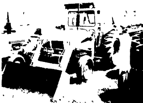
CASE 990 With Case 60 Full Hydraulic Loader and Cab 1978 - Very Low Hours Only Minimal Use - $10,900