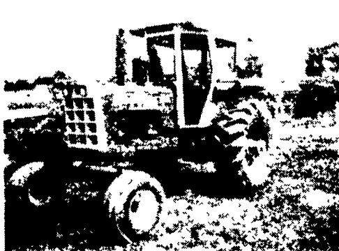
NICE ORIGINAL OLIVER 1855 - 3100 Hrs., over/under, Good Buy For A Good Tractor $7700.