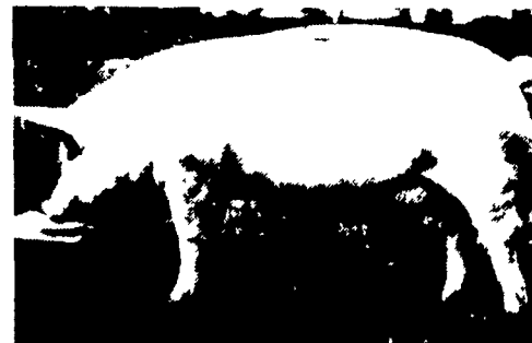
Pennsylvania's Record Selling State Sale Bred Gilt

19 Carrying Service To Top Indexing Boar Ohio Test Station, 14 Landrace Bred York. Crossbred Gilts Bred For 3 Way Cross.