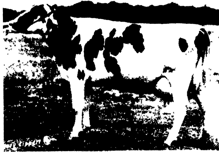
HI-DE-HO Glendell Nicki is the dam of Hi-De-Ho Fagin Nat-ET, one of six young Pennsylvania bred bulls picked for progeny testing programs.