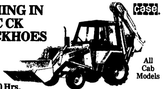
All Cab Models