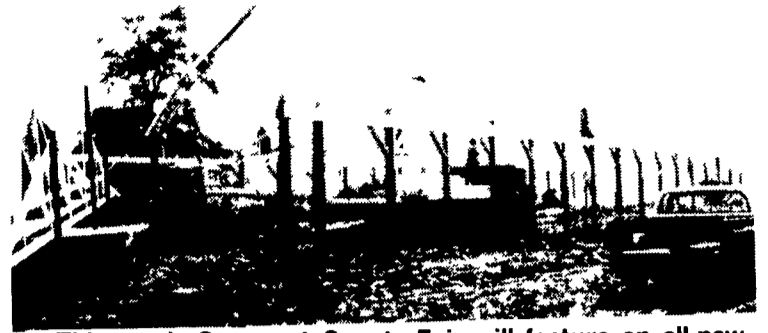
This year's Somerset County Fair will feature an all-new animal building located on the fairgrounds in Meyersdale.

Afternoon motorcycle drag racing will take place on Saturday with the Fullerton Destruction Derby, beginning at 7 p.m. and insuring that this year's fair goes out with a bang.