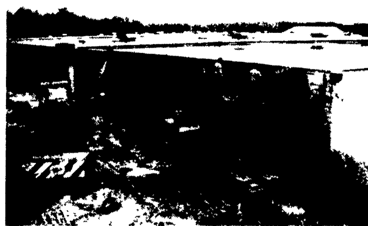
Block Wall Being Restored With Gunite