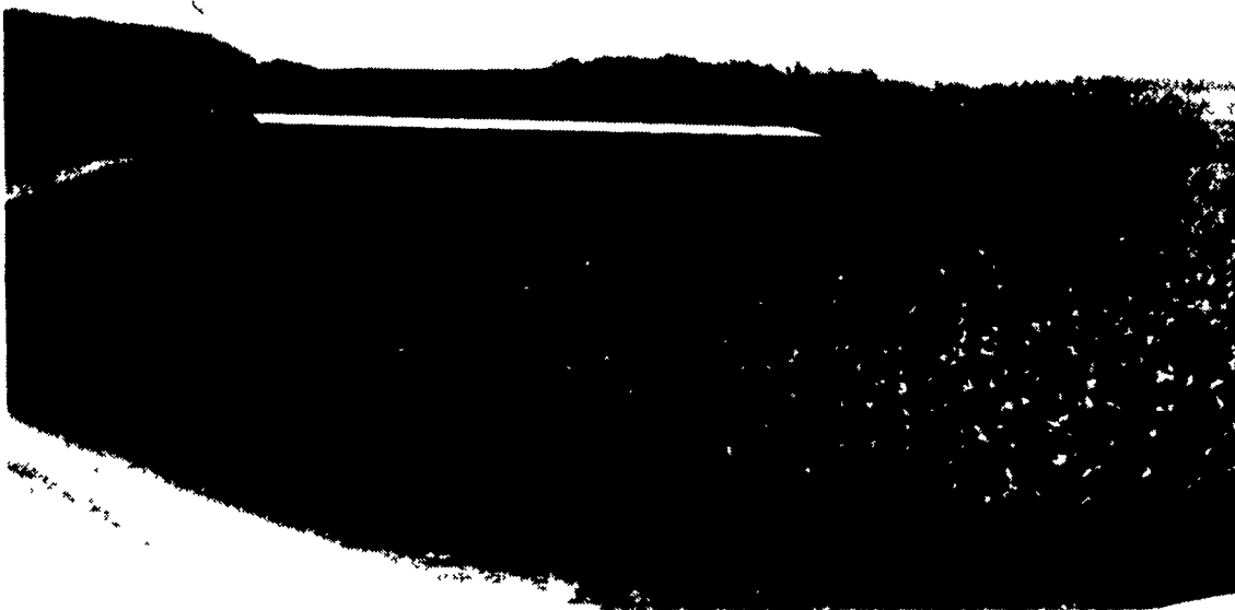
First building of new 1250-sow operation begins to take shape in York County.

"We're working to locate them in areas with sufficient acreage to support them and in areas where they are acceptable."