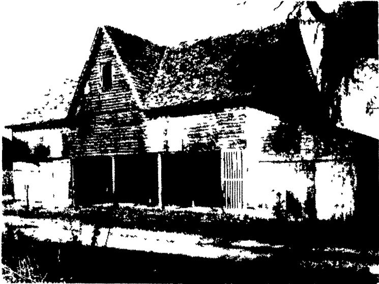
Greenlawn Stable in Middletown, Del. is among farm buildings included in special exhibit upcoming at Winterthur in Odessa, Del.

Recording the Delaware Farm: Agricultural Buildings in Southern New Castle County is supported in part by a grant from the Delaware Humanities Forum. The exhibition will be on view Tuesday through Saturday, 10 a.m. to 4:30 p.m., and Sunday 1 p.m. to 4:30 p.m., Sept. 8 through Nov. 11. The exhibition