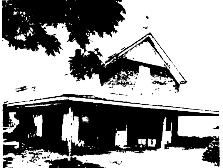
Carriage house at Woodlawn, Middletown, Del. will be featured in farm exhibit planned at Winterthur in Odessa.