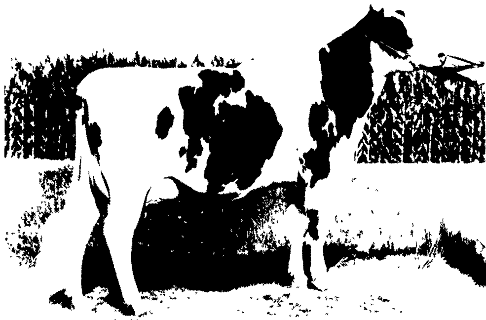
CAR JAY VER ALVIRA - A Daughter of 29H3815 Milkmaster

29H3815 Gil-Tex-B Milkmaster - Twin VG-86