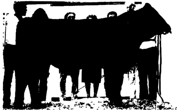
Grand champion bull was Dutchman 10336334, an April, 1983 son of Pine Drive Big Sky. Owned by Huntingdon Farm and Northcote, of Alexandria, the bull was bred by Huntingdon.