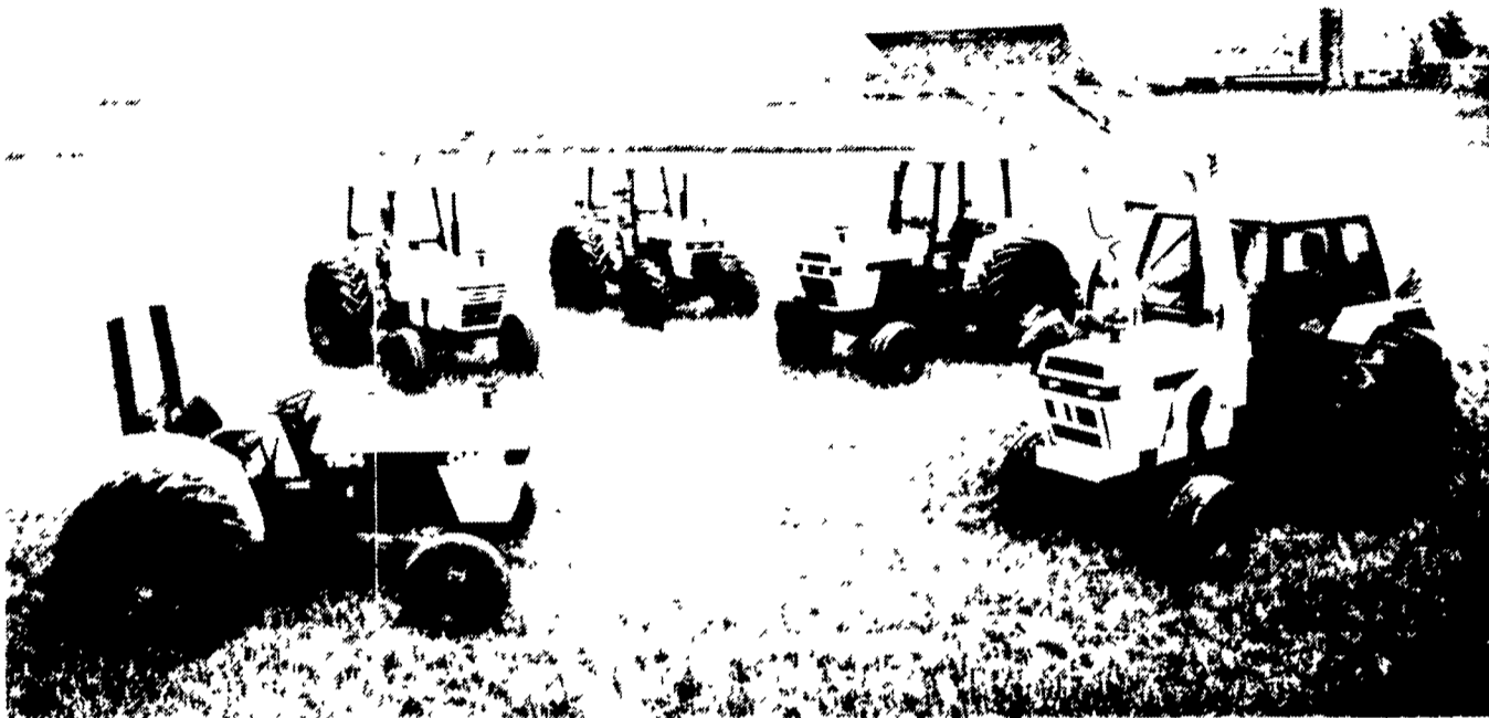
Model 1194, 43 hp (32kW)* Model 1294, 55 hp (41kW)* Model 1394, 65 hp (48kW)* Model 1494, 75 hp (55kW)* Model 1594, 85 hp (63kW)*

Whatever your power requirements see your Case dealer for value, attractive financing confidence and productive tractors that are a pleasure to own and operate. Ask him about TOPS the Tailored Owner Protection System available to purchasers of new Case 94 series tractors.