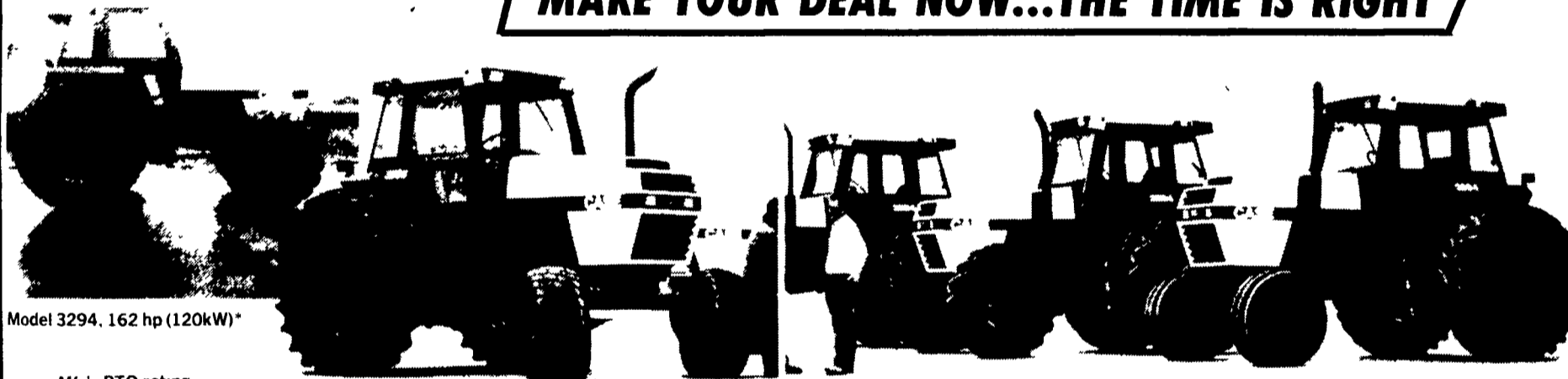
Model 3294, 162 hp (120kW)*