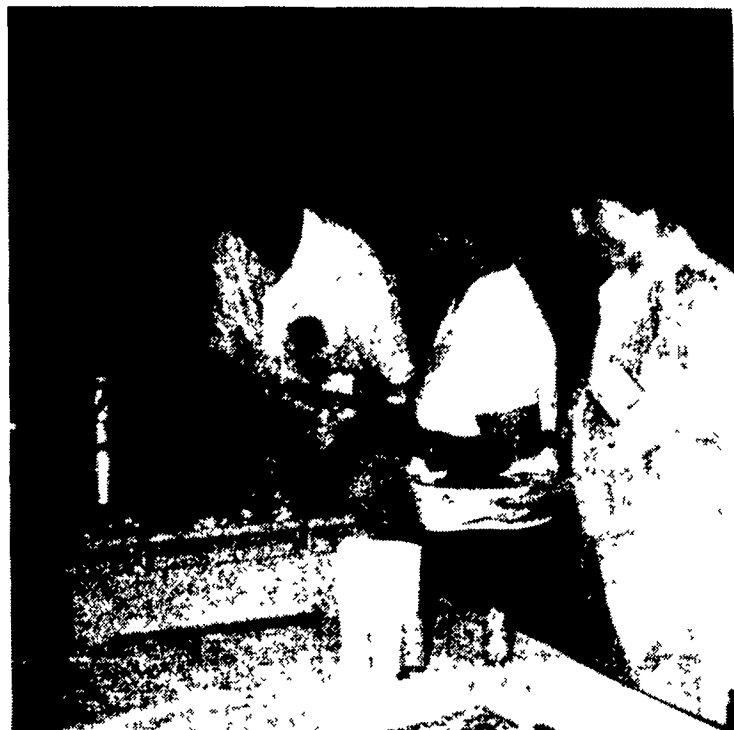
Guests from across the Commonwealth enjoyed the Pa. Dutch fixin's at Young Farmer gathering.