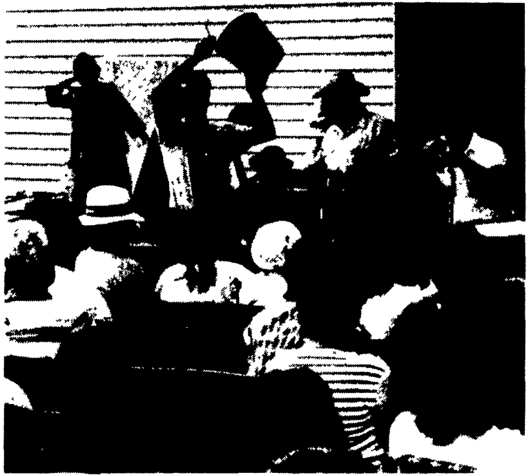
Brand new milk pail, never used, is sold.