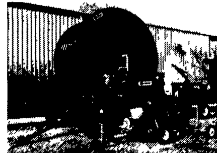
Choose from 19 Water-Reel models.