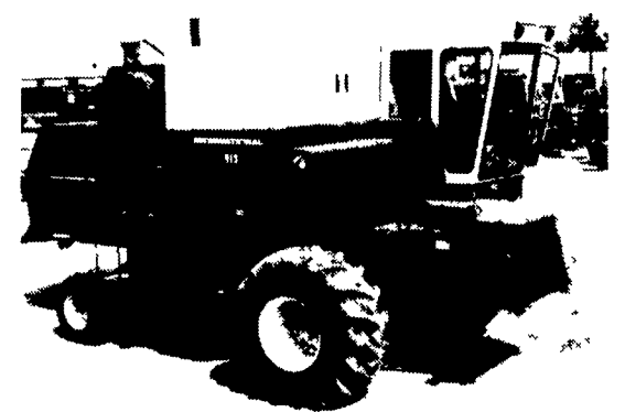
U7961 - IH 915D, 28Lx26, 12.4x16 Tires, A/C, Monitor AHC. 1475 Hours