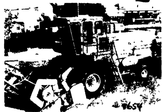
U8654 - MF - 750D 23.1x30 Tires, Hydro, A/C. 15' Flex Platform